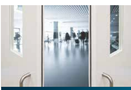
BioDoor ® Severe duty door ranges constructed to client specification or supplied as complete solutions.